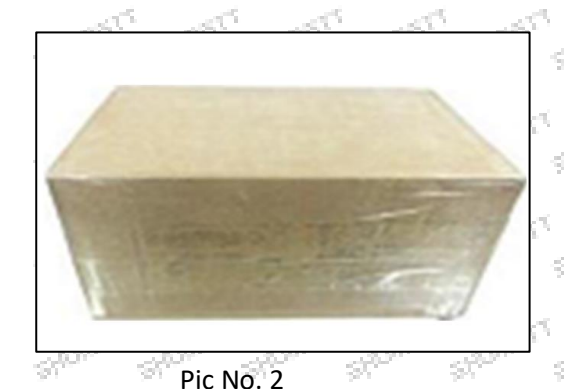
Domestic express packaging:

Minors are prohibited from using transparent tape, yellow tape, black wrapping protective film, and white wrapping protective film to avoid personal injury.